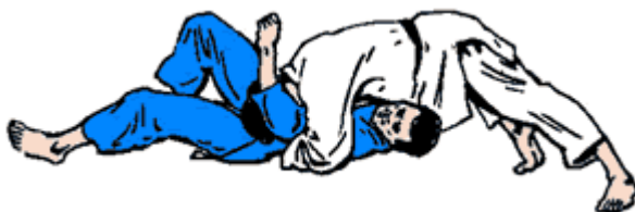
Kuzure Kami Shiho Gatame ( Modified Top Four Corner Hold )