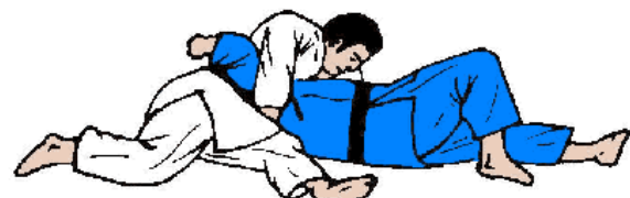
Ushiro Kesa Gatame ( Backwards Scarf Hold )