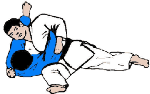
Kuzure Kesa Gatame ( Modified Scarf Hold )