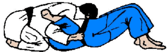
Kami Shiho Gatame ( Top Four Corner Hold )