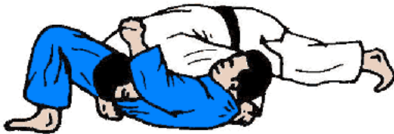
Yoko Shiho Gatame ( Side Control Hold )