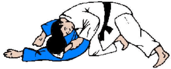
Kata Gatame ( Shoulder Hold )