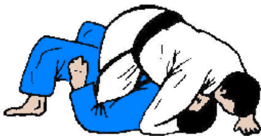
Tate Shiho Gatame ( Vertical Four Corner Hold )