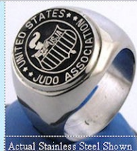
Actual Stainless Steel Shown

With your new or upgraded Life Membership - New & Existing members eligible -